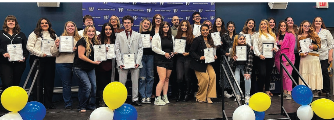
The 27 graduates of the Certified Nursing Assistant program for fall semester made it through one of the most rigorous and essential healthcare training programs in the region.