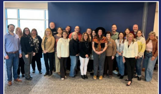
The WNC Foundation Board of Trustees is pictured during its 2026 retreat to the Nevada State Legislative Building.