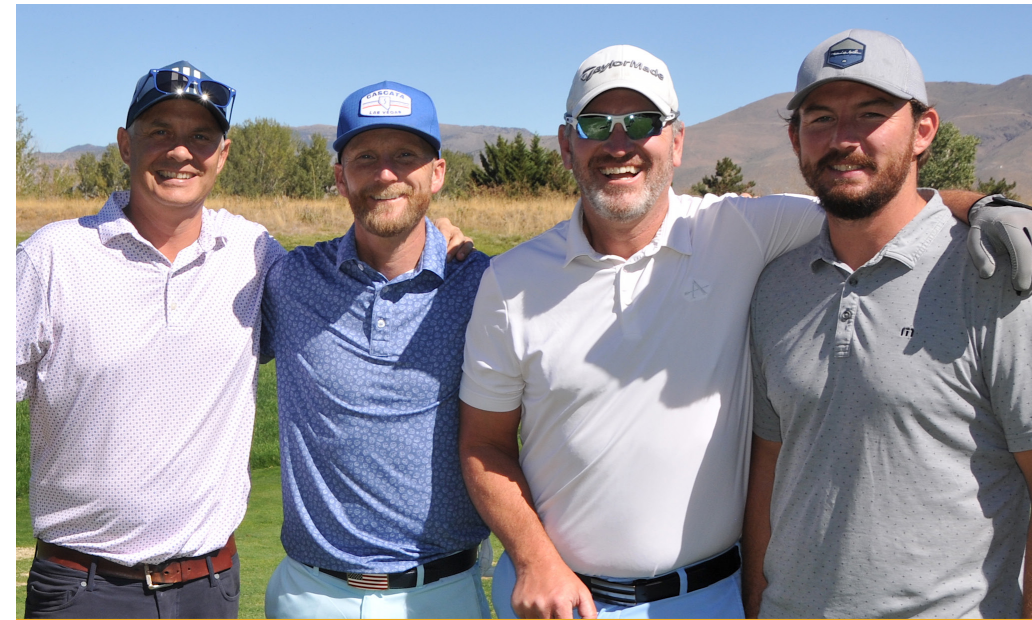
2023 Champs - Advanced Health Care of Reno