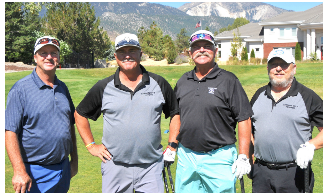
2021 Champs - Carson City Toyota team