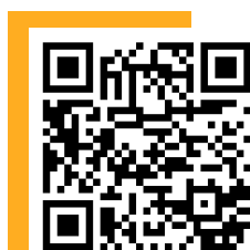
Request Transcripts QR Code

All WNC course grades will be posted on the students college transcript. As students are preparing to transfer from WNC to other post-secondary institutions, they will request official transcripts on the WNC, Admissions and Records web page: https://www.wnc.edu/admissions/records.php