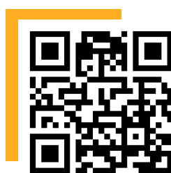
WNC Book Store

Students can access their textbooks through WNC's Bookstore. The "Textbook Lookup" allows the student to search for their textbooks by either course section or using their college ID.