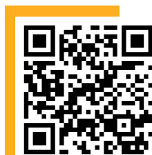
Disability Support Services

Jump Start College students may use the services provided by the Disability Support Services office, whose philosophy is to empower students to be successful in obtaining their educational goals. DSS provides necessary support to attain academic, vocational, and personal goals at WNC.