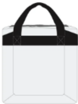
Clear Plastic Bag

*No buckles, grommets/hardware or decor can obstruct or conceal any part of the bag, including the bottom.