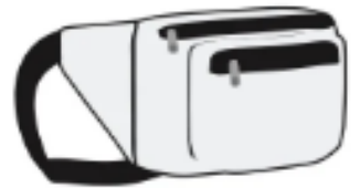
Clear Fanny Pack

The only non-clear bags permitted are small clutch-style purse or bag the size of a hand 4.5" x 6.5" maximum with or without a strap or handle